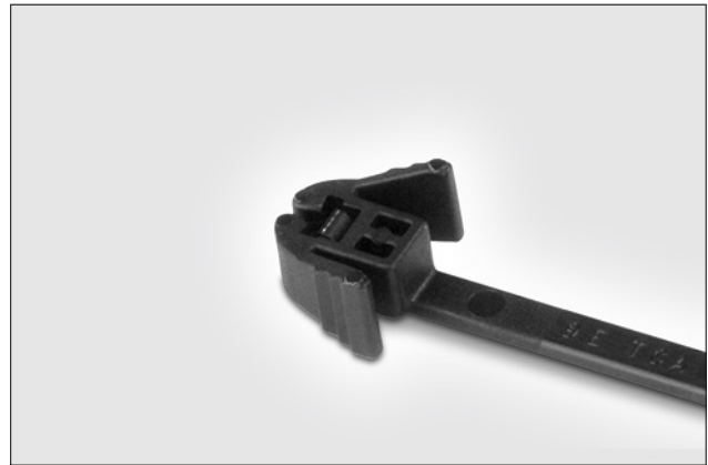
REZ series cable tie with ergonomic release mechanism.