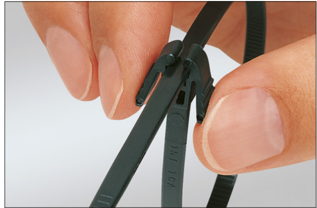
REZ ties have a simple one-hand release mechanism.