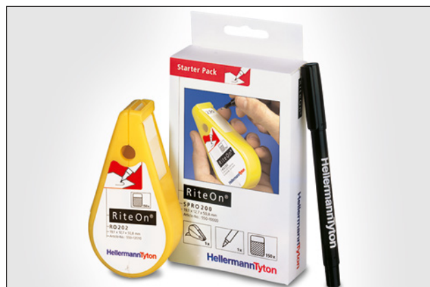
The RiteOn starter pack gets you started right away.