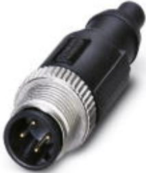
Terminating resistor PROFIBUS M12

Please be informed that the data shown in this PDF Document is generated from our Online Catalog. Please find the complete data in the user's documentation. Our General Terms of Use for Downloads are valid ( http://phoenixcontact.com/download )