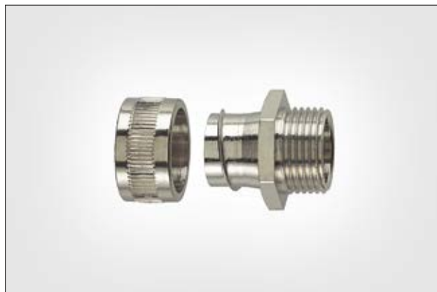
HeliaGuard SC-FM Fixed External Thread.