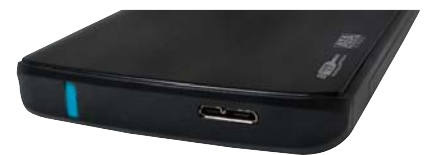
USB3.1 Gen II connector with LED indication