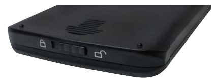
Safety HDD lock