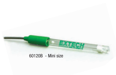
60120B - Mini size