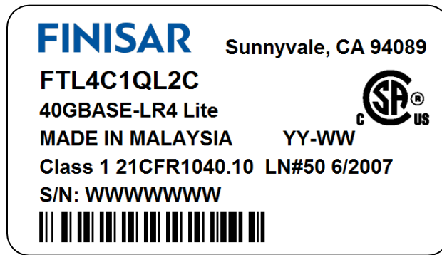
Figure 3 – FTL4C1QL2C label (not to scale)