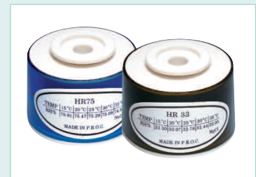
RH300-CAL Optional calibration salt bottles