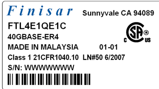
Figure 3 – FTL4E1QE1C production label