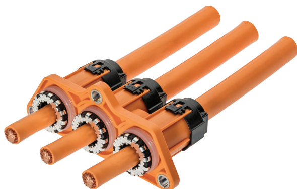
AK pass-through 3way