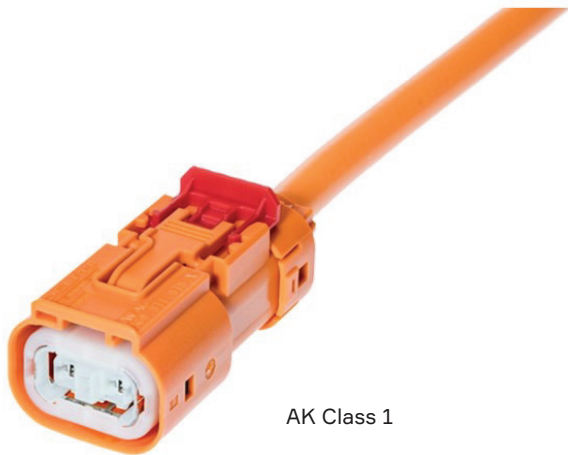
AK Class 1