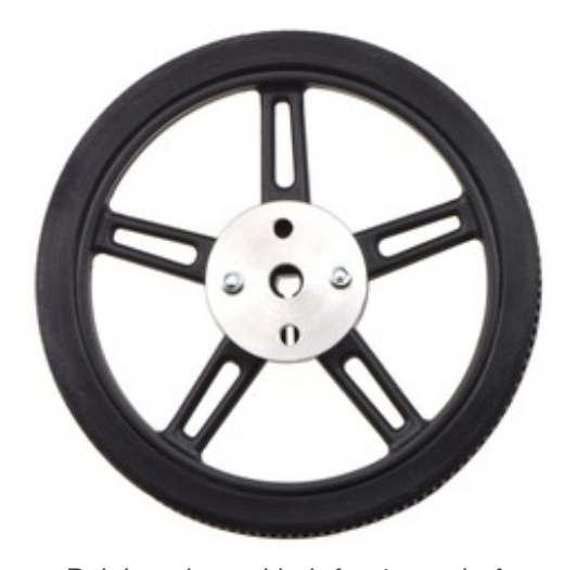
Pololu universal hub for 4mm shaft mounted to Pololu 60×8mm wheel.