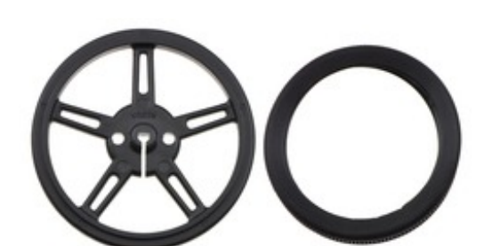
60×8mm wheel with tire removed.