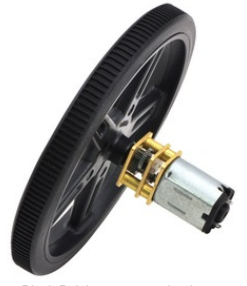
Black Pololu 70×8mm wheel on a Pololu micro metal gearmotor.

We have similar wheels available in different sizes and colors: