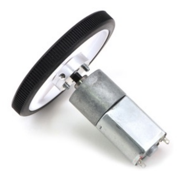
White Pololu 60×8mm wheel on a Pololu 20D mm metal gearmotor.

The left picture below shows this wheel mounted to a 20D mm metal gearmotor with a universal mounting hub for 4mm shafts. The right picture below shows a slightly larger version of this wheel mounted to a micro metal gearmotor.