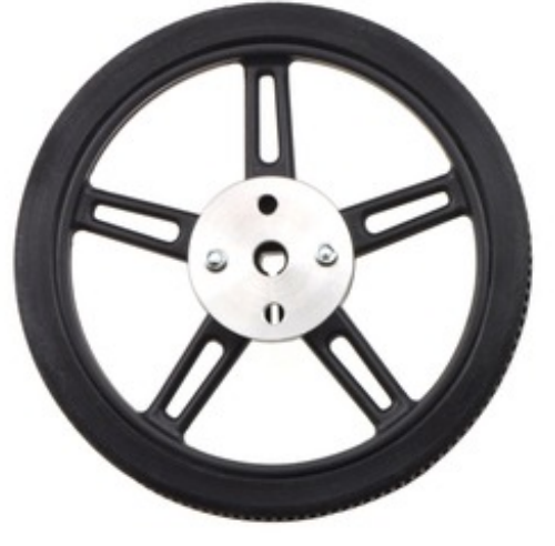
Pololu universal hub for 4mm shaft mounted to Pololu 60×8mm wheel.

Mechanical drawing of Pololu wheel 60×8mm without tire.