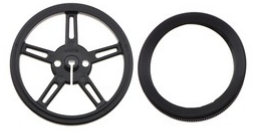
60×8mm wheel with tire removed.