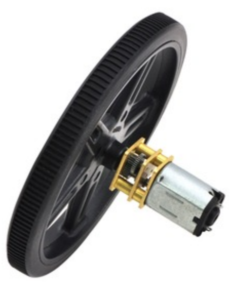
Black Pololu 70×8mm wheel on a Pololu micro metal gearmotor.

We have similar wheels available in different sizes and colors: