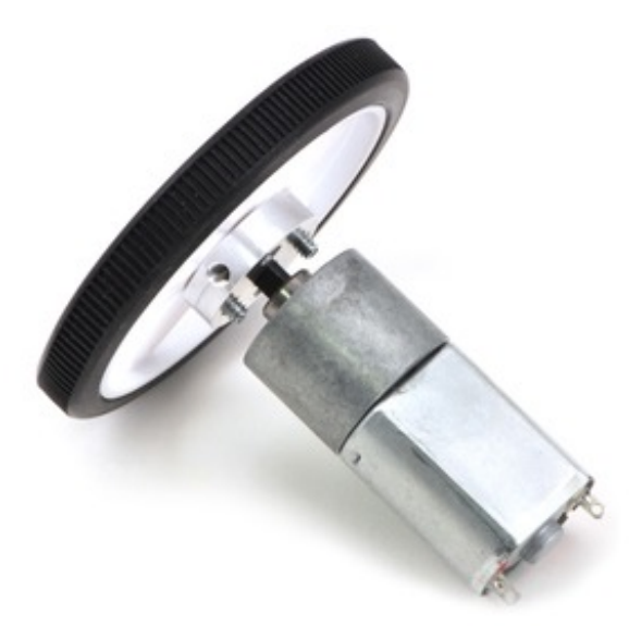
White Pololu 60×8mm wheel on a Pololu 20D mm metal gearmotor.

The left picture below shows this wheel mounted to a 20D mm metal gearmotor with a universal mounting hub for 4mm shafts. The right picture below shows a slightly larger version of this wheel mounted to a micro metal gearmotor.