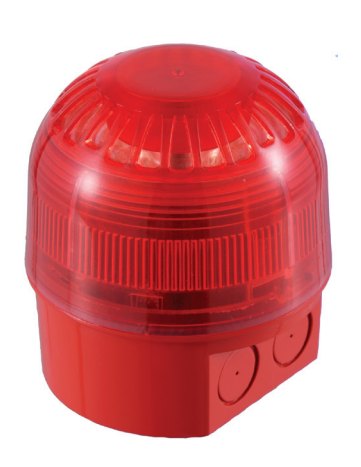
Applications - Safety; industrial alarm