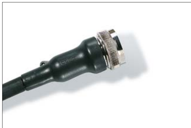
150 Series boot recovered onto a connector.

For Material / Adhesive information please refer to page 244.