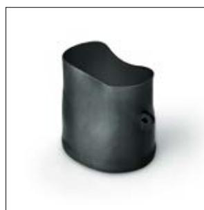
150 Series supplied.