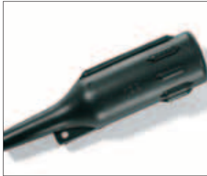
Recovered 199-4-G, VG style shape for small audio connectors with external ribs for improved grip.

Straight plug-and-socket connector terminal casing. This style is used in conjunction with circular grooved adaptor, providing protection against environmental stresses. The inside lip has been designed to provide extra reinforced stress relief. Special fitting 199-4-G for audio plugs has external ribs for an improved grip.