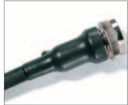
150 series boot recovered on to connector.