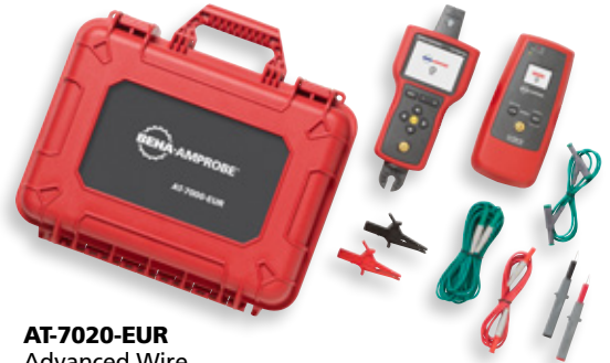
AT-7020-EUR Advanced Wire Tracer Kit