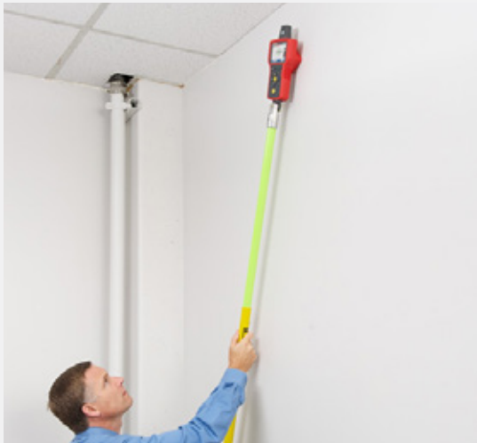
Trace wires in hard to reach places with insulation stick.

The NCV feature extends functionality of the AT-7000-RE Receiver by detecting energized wires from 90 to 600 V and 40 to 400 Hz without the use of the AT-7000-TE Transmitter. Its adjustable sensitivity fits a range of applications, from detecting presence of voltage (higher sensitivity) to precisely pinpointing a hot wire in a bundle (lower sensitivity).