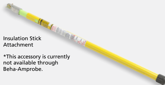
Insulation Stick Attachment

A standard insulation stick can be attached to the AT-7000-RE Receiver to easily trace wires in high ceilings, walls, and along floors. The stick can be purchased from electrical distributors.*