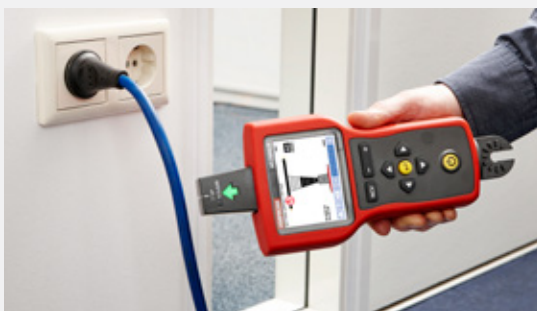
Non-contact voltage (NCV) detection.

When used with the AT-7000-TE Transmitter, the Tip Sensor pinpoints the location of energized and de-energized wires in tight, hard to reach spaces. It easily and accurately traces the targeted energized and de-energized wires in junction boxes, corners, walls, floors and ceilings to a depth of up to 6.1 meters (20 feet).