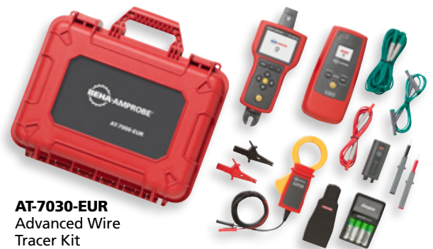
AT-7030-EUR Advanced Wire Tracer Kit