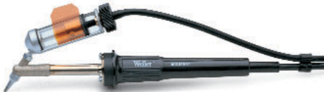
DSX 80 (DS 80 UNC*) 5 33 138 99 (5 13 191 99)

The HAP 1, 100W/24V, provides a directional hot airflow that is adjustable and static-free. Electronically temperature controlled from 50°C to 550°C. Different nozzles available as accessories. Finger switch controls speed adjustable pump. Hot air pencil set, consisting of HAP 1 with finger switch, KH 27 Support for pencil, nozzle 1,2 and 3,0 mm, key and nutdriver for nozzle changing.