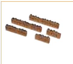
Terminal block supports