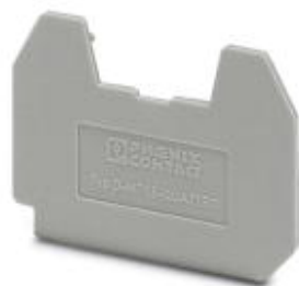
End cover, length: 33.6 mm, width: 1 mm, height: 24.3 mm, color: gray

Please be informed that the data shown in this PDF Document is generated from our Online Catalog. Please find the complete data in the user's documentation. Our General Terms of Use for Downloads are valid ( http://phoenixcontact.com/download )