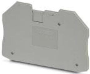
End cover, Length: 65 mm, Width: 2.2 mm, Height: 50.4 mm, Color: gray

Please be informed that the data shown in this PDF Document is generated from our Online Catalog. Please find the complete data in the user's documentation. Our General Terms of Use for Downloads are valid ( http://phoenixcontact.com/download )