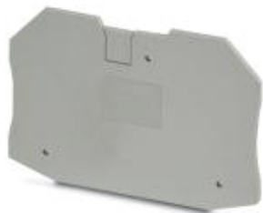
Cover, width: 2.2 mm, color: gray

Please be informed that the data shown in this PDF Document is generated from our Online Catalog. Please find the complete data in the user's documentation. Our General Terms of Use for Downloads are valid ( http://phoenixcontact.com/download )