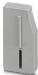
Spacer plate, Width: 4 mm, Number of positions: 0, Color: gray

Please be informed that the data shown in this PDF Document is generated from our Online Catalog. Please find the complete data in the user's documentation. Our General Terms of Use for Downloads are valid ( http://phoenixcontact.com/download )