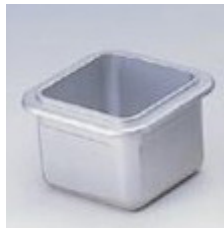
Standard solder pot

*Because the anti-corrosion test was done by our way, longevity of solder pot may be different according to the usage condition.