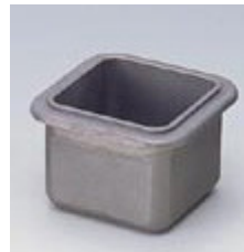
Special solder pot