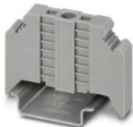
End clamp, width: 9.5 mm, color: gray

Please be informed that the data shown in this PDF Document is generated from our Online Catalog. Please find the complete data in the user's documentation. Our General Terms of Use for Downloads are valid ( http://phoenixcontact.com/download )