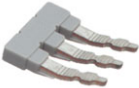
Insertion bridge, Number of positions: 3, Color: gray

Please be informed that the data shown in this PDF Document is generated from our Online Catalog. Please find the complete data in the user's documentation. Our General Terms of Use for Downloads are valid ( http://phoenixcontact.com/download )