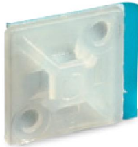
Hole for #6 screw