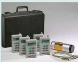
407355-KIT-5 Dosimeter Kit

Includes PC Windows® compatible software to maintain records and statistically analyze acquired data