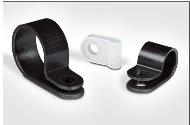
P-Clips H1P - H18P in different dimensions.