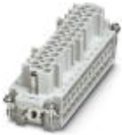
HEAVYCON female insert, B24 series, 24-pos., screw connection

Contact insert - HC-B 24-I-UT-F - 1648306