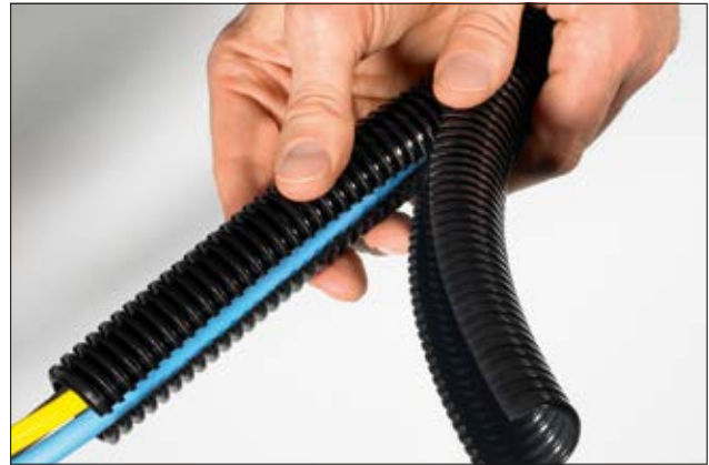
HelaGuard HG-DC double slit conduit is ideal for retrofitting.