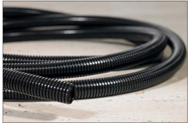
HelaGuard PA6 Light is very flexible and can be used in moving applications.