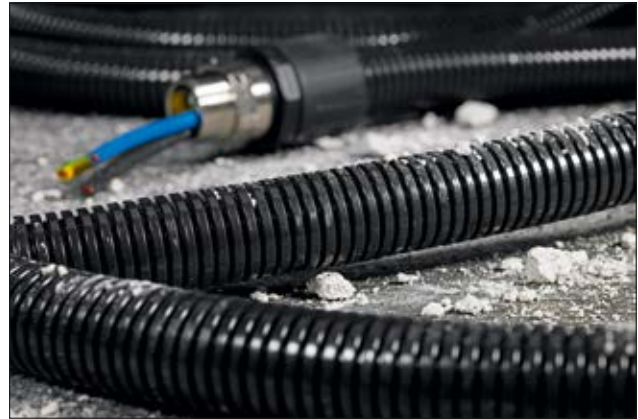
HelaGuard PA6 Standard for industrial applications.