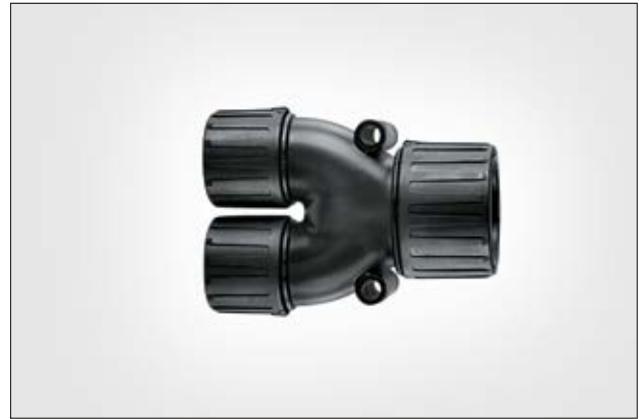
HeliaGuard HG-Y, Y-Connector, IP66.