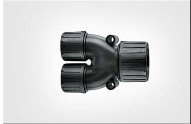
HeliaGuard HG-Y, Y-Connector, IP66.