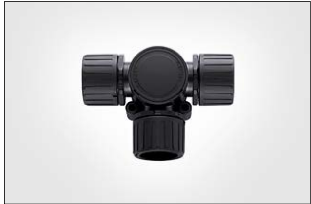
HeliaGuard HG-T, T-Connector, IP66.