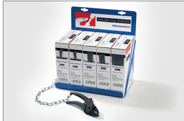
HIS-Service Station contains 5 dispensers and a special cutter.