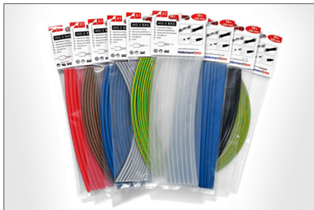
HIS-3 BAG available in seven colours and four sizes.