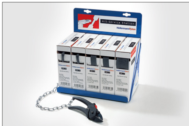
HIS-Service Station contains 5 dispensers and a special cutter.