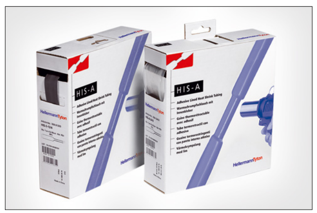
HIS-A - with adhesive liner