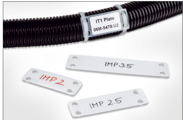
Unlimited cable bundle diameters can be securely identified.