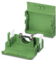
Cable housing, Pitch: 0 mm, Number of positions: 5, Dimension a: 25 mm, Color: green

Please be informed that the data shown in this PDF Document is generated from our Online Catalog. Please find the complete data in the user's documentation. Our General Terms of Use for Downloads are valid ( http://phoenixcontact.com/download )