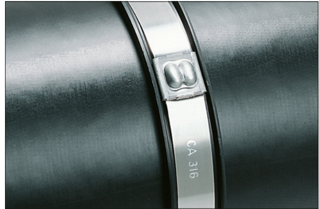
Cable tie MBTXH with LFPC Protective Channel.