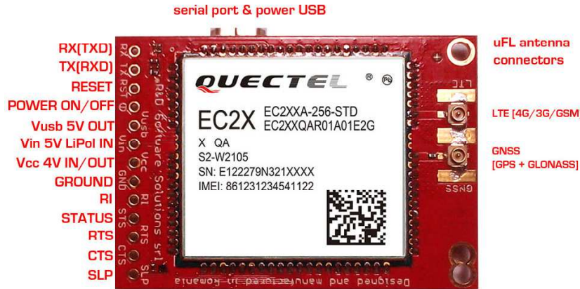
4G [LTE] SHIELD I-LTE v 1.07 top PCB view