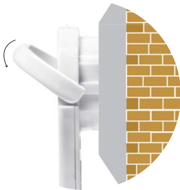
With ergonomic folding handle