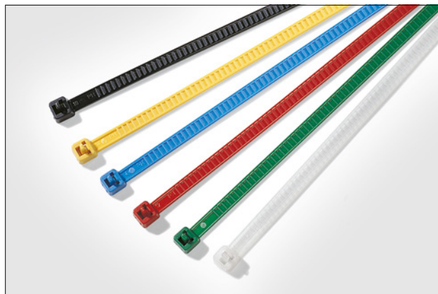
The LR55 cable ties are reusable and ideal for colour coding.