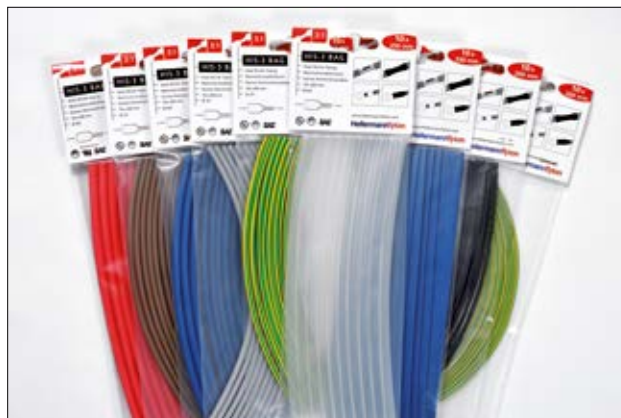
HIS-3 BAG available in seven colours and four sizes.