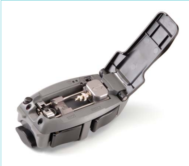
UniCam Pretium Installation Tool