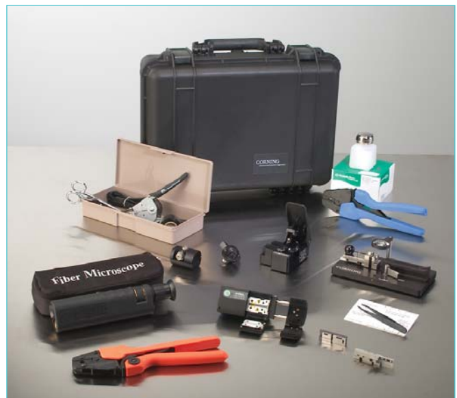
UniCam MTP® Connector Installation Tool Kit | Photo LAN598