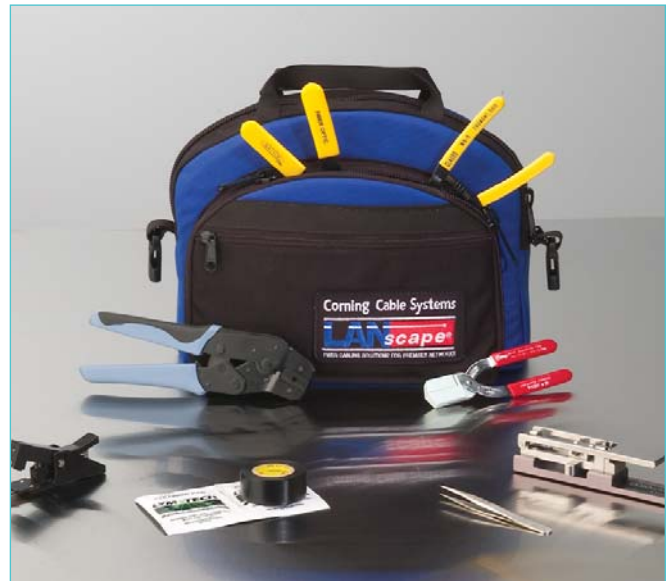
UniCam Connector Standard Installation Tool Kit | Photo LAN596

For quick termination of ribbon cables, the UniCam MTP® Connector Installation Tool Kit (TKT-UNICAM-MTP) is a single-ferrule design that terminates 12 fibers at a time on one connector. Compact and easy to carry, the kit contains a high-performance ribbon cleaver for superior cleave performance. The TKT-UNICAM-MTP also includes a ribbon coating thermal stripper, ribbon insertion tool, crimp tool and fiber preparation and cleaning materials.