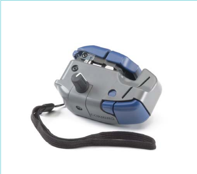
Pretium Cleaver | Photo LAN805