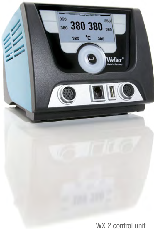
WX 2 control unit