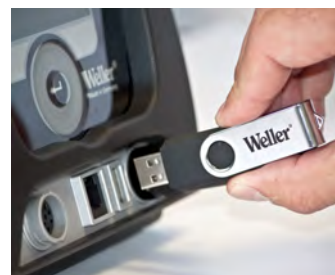
Multi-purpose USB port