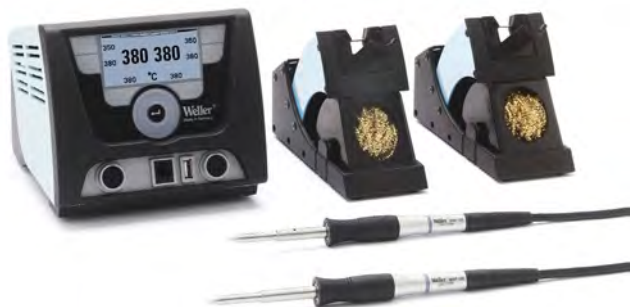
WX 2 soldering station with 2 WXP 120 soldering irons