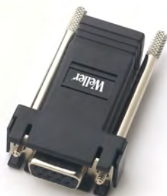
WX Adapter for PC