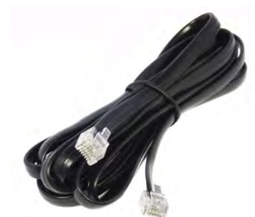
WX connection cable