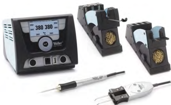
WX 2 soldering station WXMP Micro soldering iron & WXMT Micro tweezer