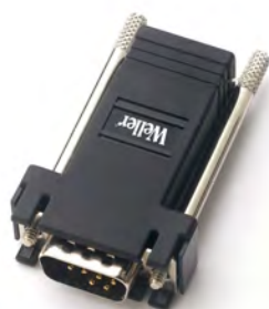
WX Adapter for WFE / WHP