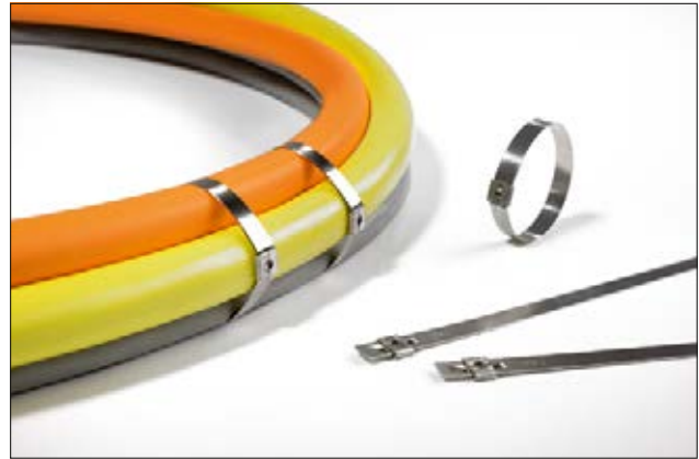
Stainless Steel Cable Ties MST-Series.